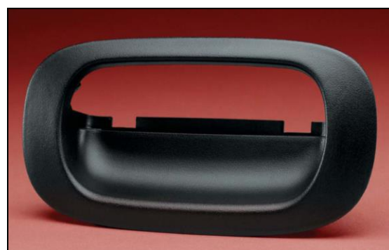
Fig. 3: In Bezel of Door Handle.

joined easily and quickly with another piece of assembly. An ideal material applied for Snap-fits is thermoplastics, because they are having certain flexibilities and necessary resilience enough to fit for the various assembly and disassembly operations (Figures 3–5).