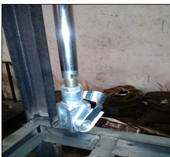
Fig. 2: Validated Snap-On Spring Fork Pin in Pneumatic Cylinder.