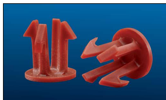
Fig. 5: Automotive Oil Filter Snaps.