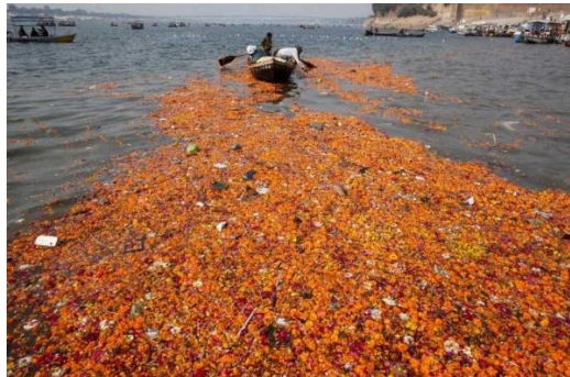
Fig 1: floral waste dumped in river; taken this from BBC news website.

of waste that originates from its Man temples. Every day waste material 3.5-4 tones deserted in city of the temples (Mishra, 2013).