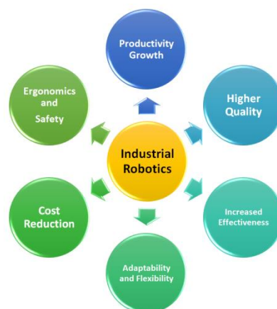
Figure 2. Industrial Robotics

Industrial robotics is the use of robotic devices to automate various processes in manufacturing and industrial settings. It entails the use of robots and automation technology to complete jobs that have historically been completed by human workers in an effort to increase manufacturing operations' productivity, efficiency, and quality [14].