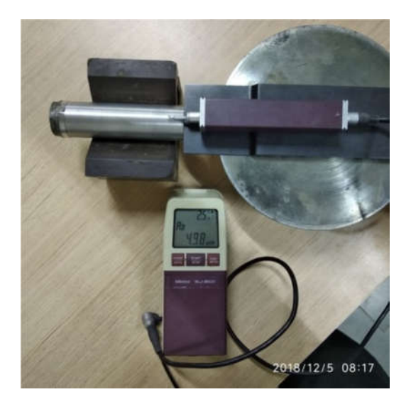
Fig. 4. Surface roughness testing at 0°

Averages surface roughness were calculated and mentioned in table 4.