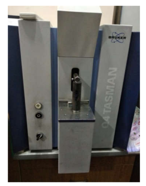
Fig. 2. Chemical Analysis by optical Emission Spectrometer

Cutting tool Insert is selected from Kyocera Inc. with has ISO P-10 grade cermet insert of ISO designation TNMG160408HQ for this dry machining process. Ti(C,N) based cermet insert of TN 6020 grade is having super micro grain structure.[10] As per the recommendation of manufacturer parameter, this cermet based insert will be used at cutting speed of 180 to 340 m/min and feed of range 0.1 to 0.25 mm/rev. But the information collected from different industries that cermet insert can work efficiently at cutting speed nearer to 400 m/min.