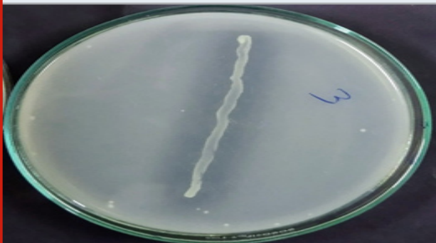
Figure 2: Solubilization of phosphate as seen around the bacterial isolate.

Phosphate solubilization: Phosphorus is one of the major essential macronutrients for plant growth and development. However, the concentration of soluble P in the soil is very low (Zhu et al., 2011). The use of phosphate solubilizer bacteria as inoculants will increase P intake by plant and cultivation at the same time (Olanrewaju et al., 2017). Of the 57 bacterial isolates, 49 isolates solubilized tri-calcium phosphate as indicated by the production of clearance zone around the bacterial colony on Pikovskaya's agar medium plates (Table 2). Solubilization of tri-calcium phosphate requires either acid production or chelate formation by the bacterium in the medium. Probably other isolates did not produce acid insufficient amount or chelate to solubilize tri-