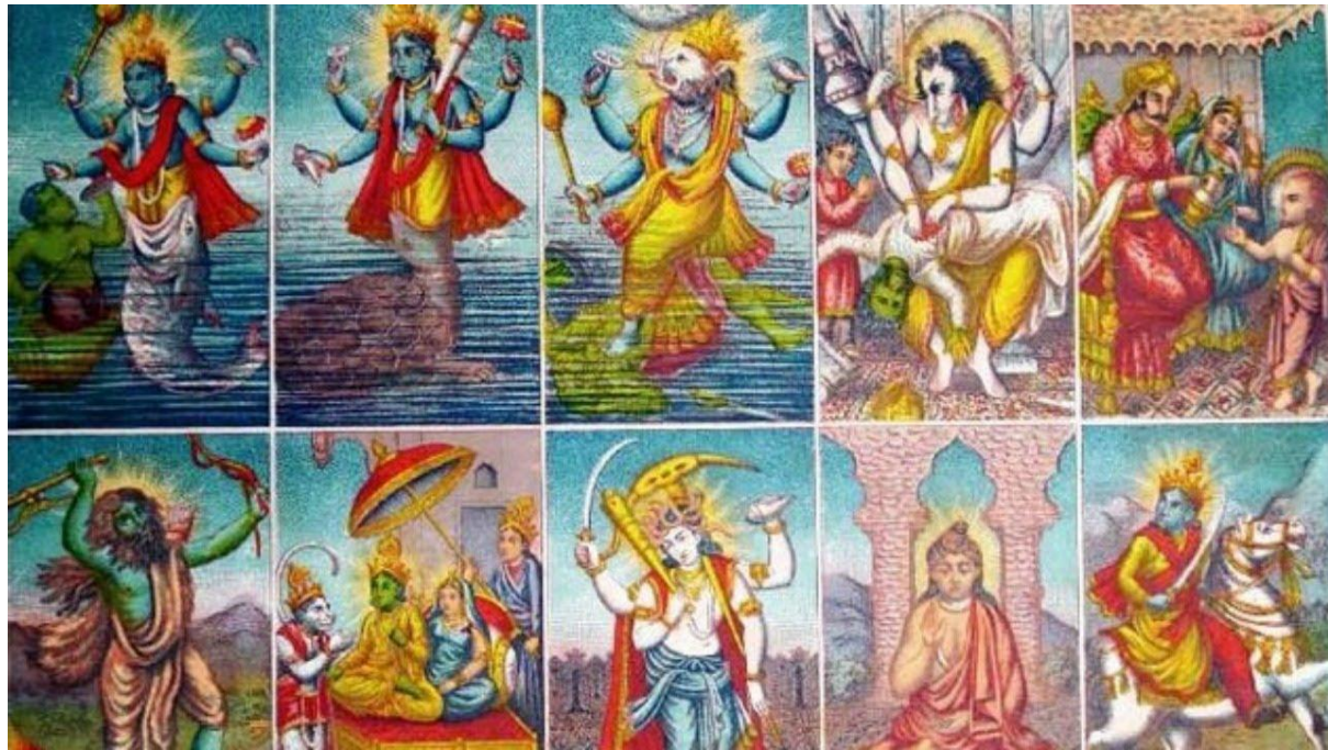
Figure 1.2 Vishnu's Divine Manifestations