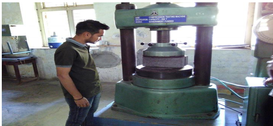
Figure 2: Setup of Compressive Strength Test

381 mm × 229 mm × 153 mm concrete blocks Specimens with Ordinary Portland cement (OPC) and grit (6-10mm) partially replaced by and Kota stone chips, accordingly at 20%, 40%, 60%, 80% level is cast, individually. During casting, the blocks are made in the hand press machine. After making the specimens are removed from the moulds and subjected to water curing for 2 days. After curing, the specimens are tested for compressive strength using a calibrated compression testing machine of 2,000 KN capacities. The compression test is carried out on the specimens at the end of 7 days, 14 days and 28 days of curing.