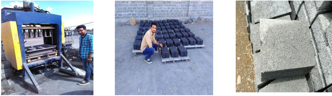
Figure 1: Manufacturing Process of Concrete Blocks